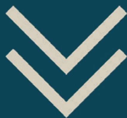
Chart Your Path to a Preferred Future